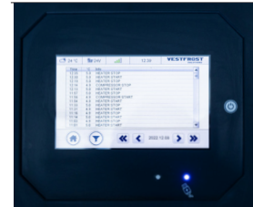
Remote alarm logs