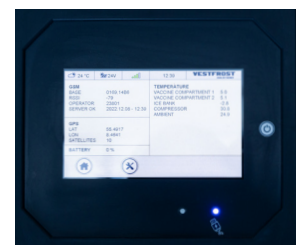
GPS coordinates & GSM connectivity