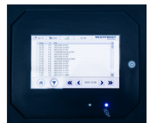
Remote alarm logs